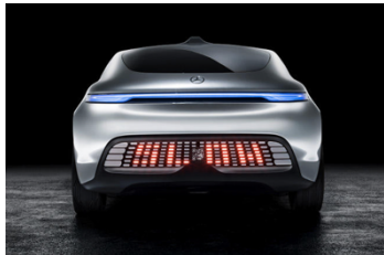
Figure 2: Concept car by Mercedes Benz equipped with a low-resolution display. Photo: ©Mercedes Benz