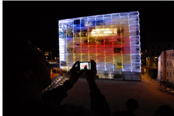
Figure 1: Low-resolution media façade of the ARS Electronica Center in Linz, Austria.