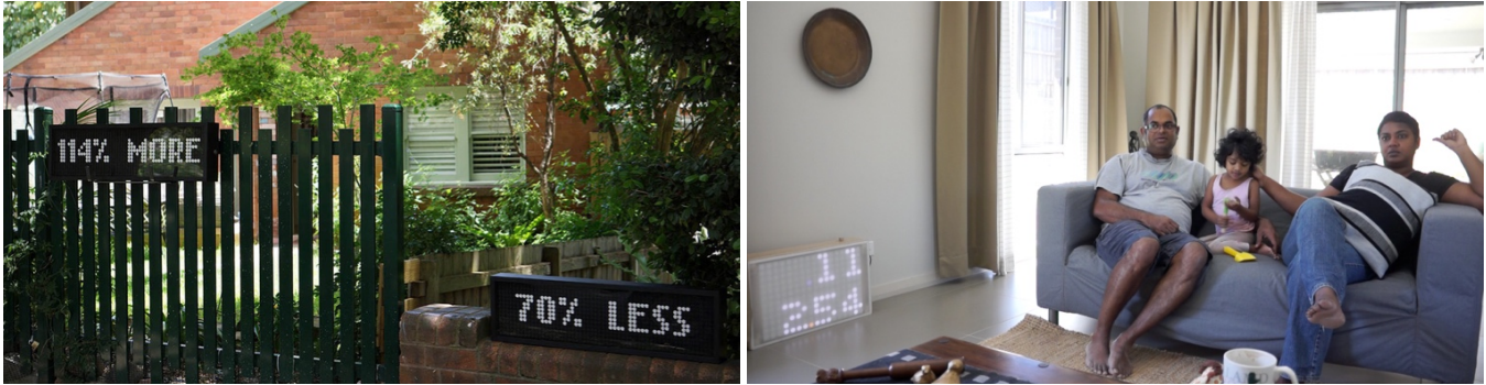
Figure 1. Low-resolution displays in two opposite residential contexts: Flip-dot displays installed at two households showing the comparison of energy consumption in the neighborhood (left), LED display deployed in the living room area of a household, displaying solar production and energy consumption (right).

m.hoggenmueller@gmail.com, alexander.wiethoff@ifi.lmu.de, andrew.vandemoere@kuleuven.be, martin.tomitsch@sydney.edu.au