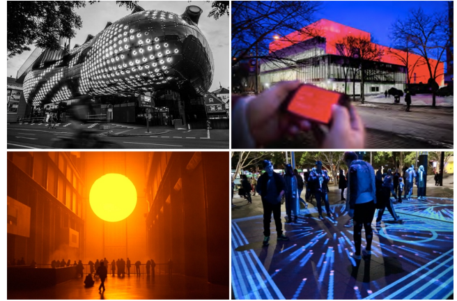
Figure 2. (1) Low-res media façade of the Kunsthaus Graz in Austria (top left), (2) interactive media façade installation controlled via twitter (top right), (3) indoor installation “The Weather Project” (bottom left), (4) full-body interactive light and sound installation.

Finally, media architecture with its communicative power and placemaking capabilities is seeking to facilitate and improve social interactions in the urban environment [41] and to stimulate essential needs in public space, such as active and passive engagement [29]. In the past, researchers have