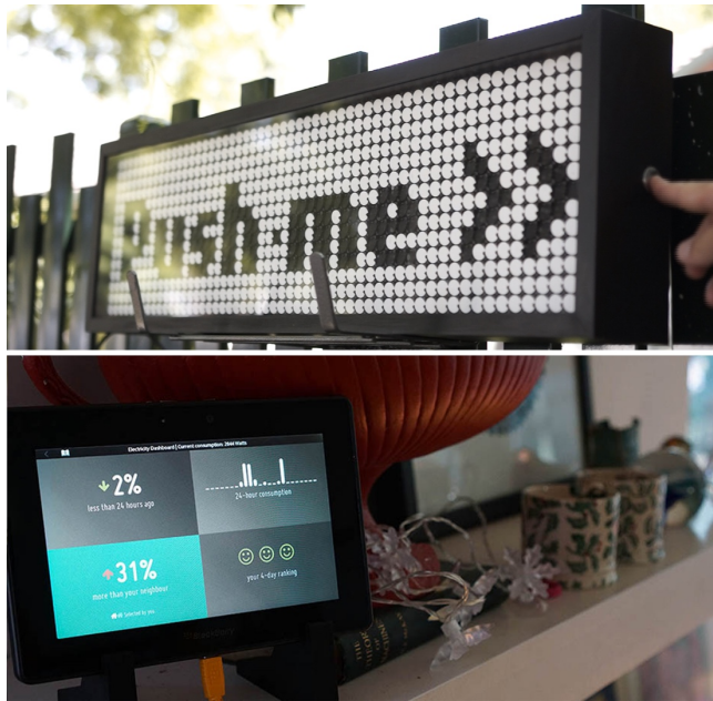
Figure 3. The Flip-Dot display with the push-button located on its side for triggering a data-driven short animation (top), and the tablet app to control the content on the low-res display (bottom).

3.1.4 System Implementation. We built two custom-made waterproof cases housing the flip-dot panels, which could be either hung onto a fence with a planter box hook or simply placed on a flat surface, such as a brick wall (Figure 1, left). The two displays were connected with two cables for power (24 volts) and data, and one of the displays was connected to a central control unit located inside one of the houses. The electricity measurement was based on OpenEnergyMonitor 1 , an open-source platform providing wireless sensors, a base receiver, and server software for statistical calculations. Using a local area network ensured the privacy of the recorded data.