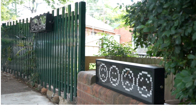
Figure 5. The Flip-Dot displays using pictorial representations to show the last four days consumption.

“[...] make use of it as a piece of light art”. On the other hand, family C 2 -H 2 who preferred the numeric representation and used the display similar to a “clock” in the background, stated that they would prefer if the display was smaller.