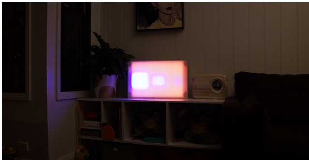
Figure 6. The Light-Shifting Display in the ambient mode, displaying the last three days' consumption.

We noticed that a decoupling of the interactive elements (e.g. a remote stationary tablet) leads to decreased interest in the displayed low-res content, while real-time and tactile feedback acted as an additional motivator. Further, in our case studies we observed long pauses between the interaction periods, especially for the usage of the web interface. Therefore, the temporal dimensions of residential media architecture should be considered in future investigations, making a link to "slow technology"-design principles [30].